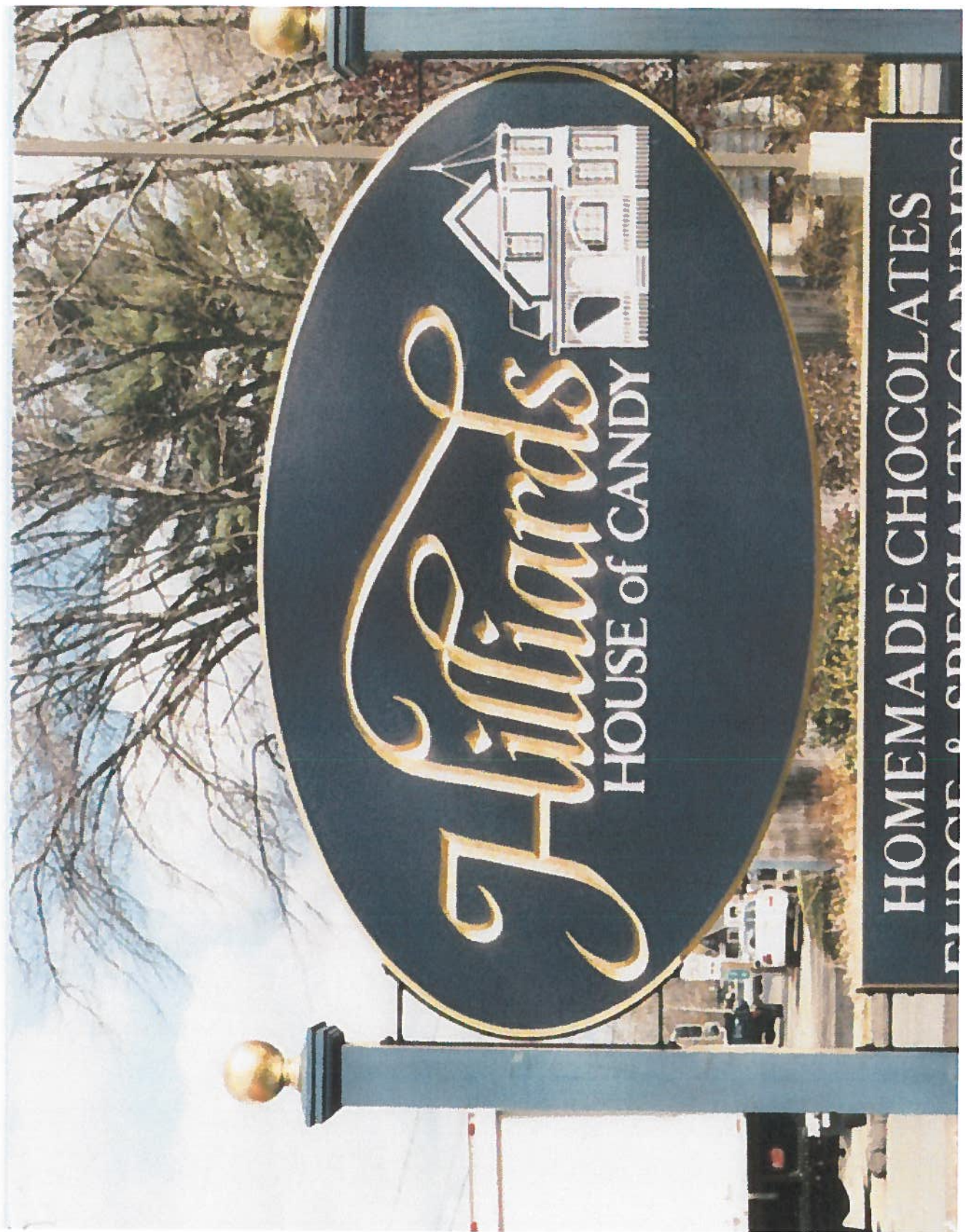
This sign is 5 years old. It has been subject to sun, rain, and snow.