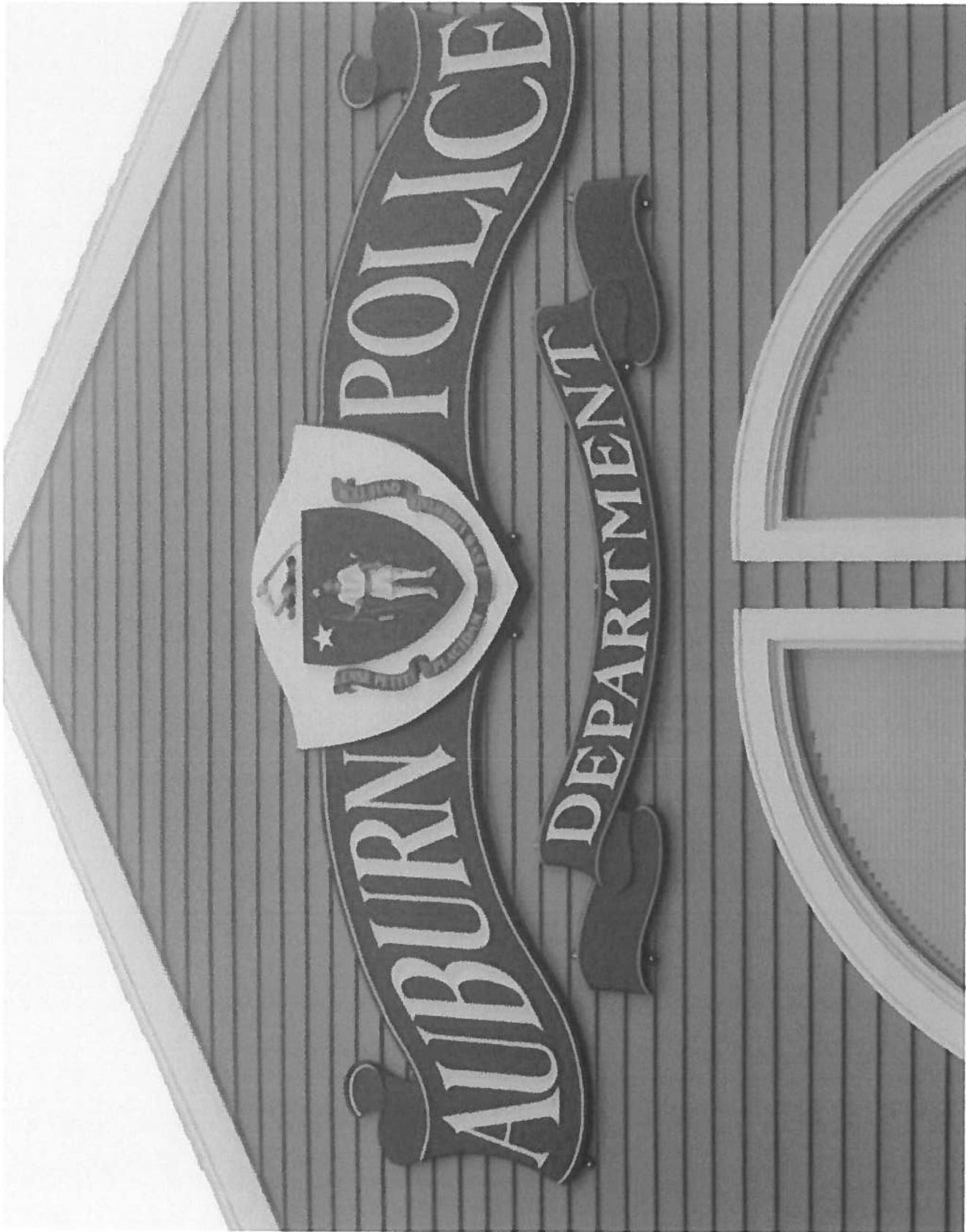
The sign in this picture is 10 years old. It has been subject to sun, rain, and snow. It is still up after 19 years.